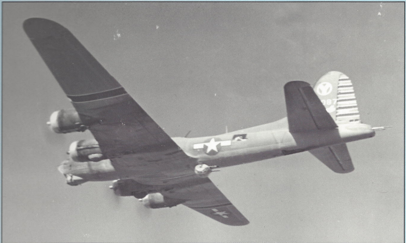
2nd Bombardment Group